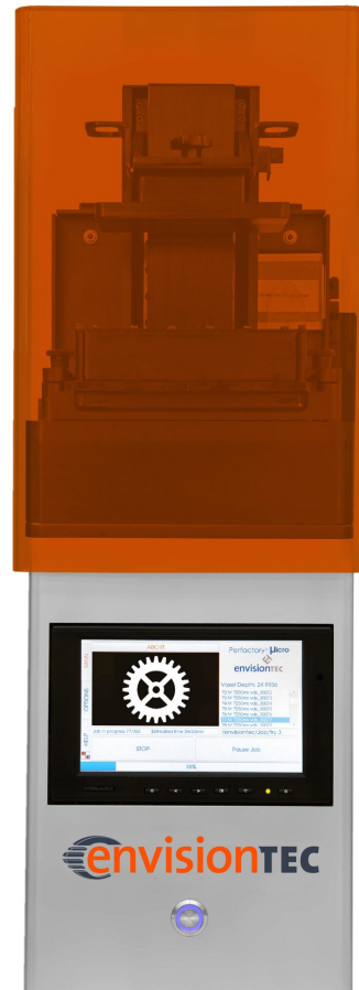
MICRO PLUS ADVANTAGE FACTORY DIRECT TO CARIBBEAN USD 18,750

The Perfactory Vida is a low-cost, open-architecture, easy-to-maintain and user-friendly 3D printer for dentists, orthodontists and digital dental laboratories.