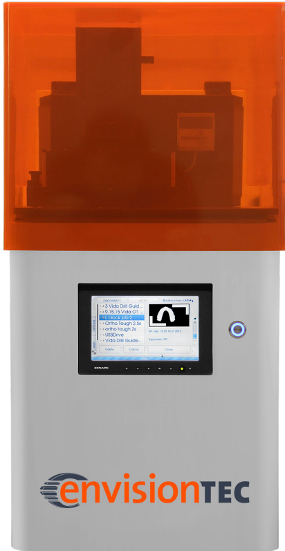
PERFACTORY VIDA FACTORY DIRECT TO CARIBBEAN USD 27,650

Sole Distributor of EnvisionTEC Printers in the Caribbean 787.360.7920 info@RichPort3D.com